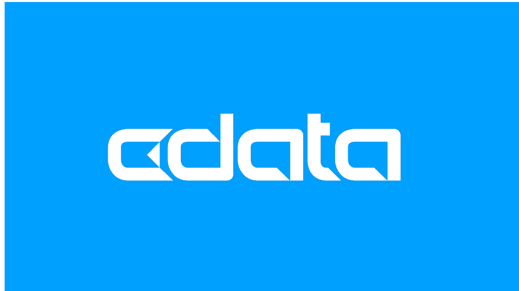
Reverse / White (Dark Backgrounds)